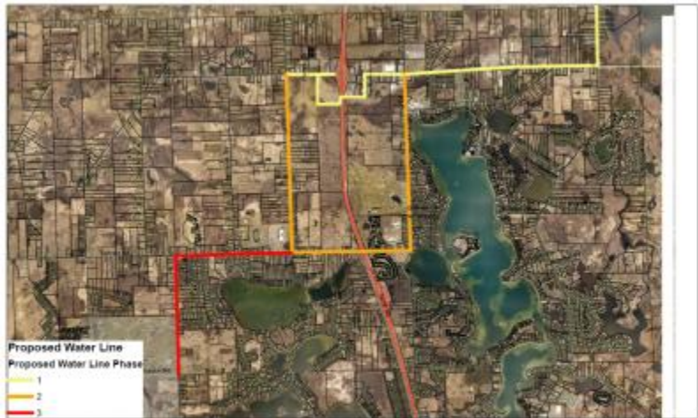
Proposed Water Line Phase Plan Phase III 2022-2025

$2,277,022 (Fenton Township $1,138,511; City of Linden $1,138,511)